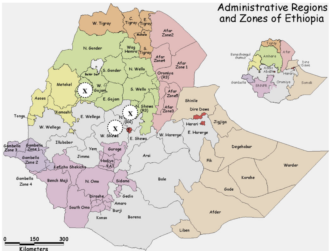
Fig. 1 Administrative regions and zones of Ethiopia. UN Emergencies Unit for Ethiopia. × represents location of districts in which the survey was carried out

and Peoples' Regional State (SNNPRs) and partly in the Oromiya region. The major potato producing zones in this area are Gurage, Gamo Goffa, Hadiya, Wolyta, Kambata, Siltie and Sidama in the SNNPRS and West Arsi zone in Oromiya. More than 30% of the total number of potato farmers is located in this area (CSA 2008/2009). Potato tubers are produced under rainfed conditions and under irrigation. Productivity usually ranges from 7 to 8 Mg ha -1 , whereas in some places potato productivity is even below 7 Mg ha -1 . About six varieties are grown, of which four are local and two are improved (Endale et al. 2008a).