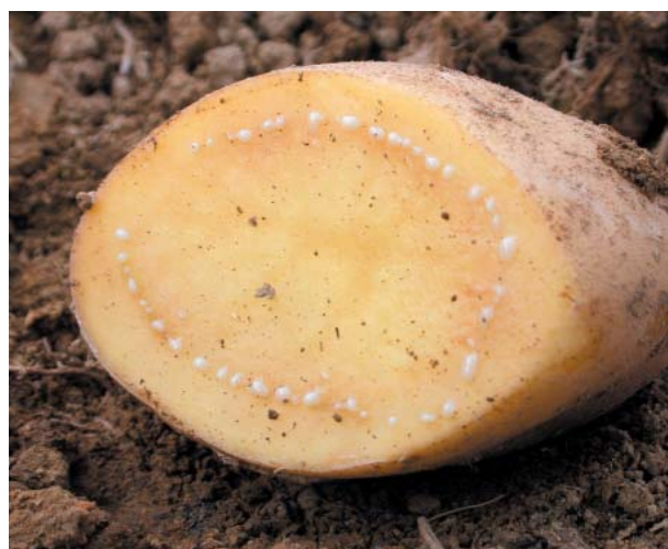
Figure 1. Symptoms of R. solanacearum on healthy looking seed tuber.

Nevertheless, the potato sub-sector is still underdeveloped in Ethiopia: yields are very low, 8–13