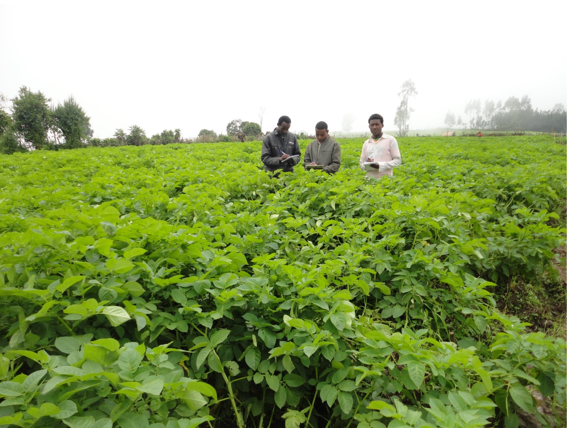
QDPM field inspection